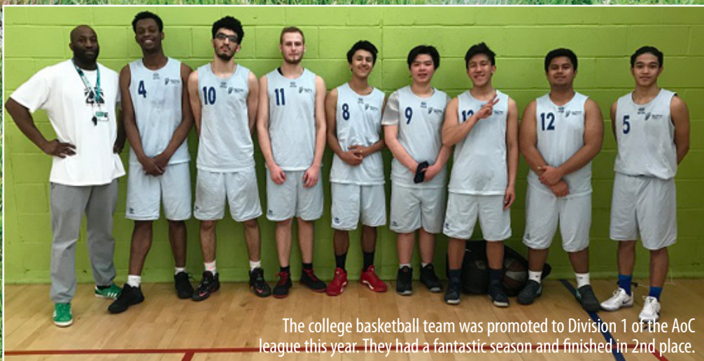
The college basketball team was promoted to Division 1 of the AoC league this year. They had a fantastic season and finished in 2nd place.