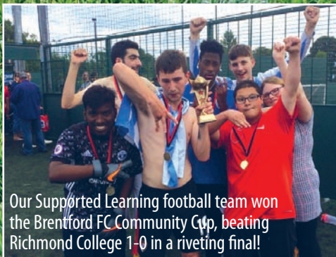
Our Supported Learning football team won the Brentford FC Community Cup, beating Richmond College 1-0 in a riveting final!