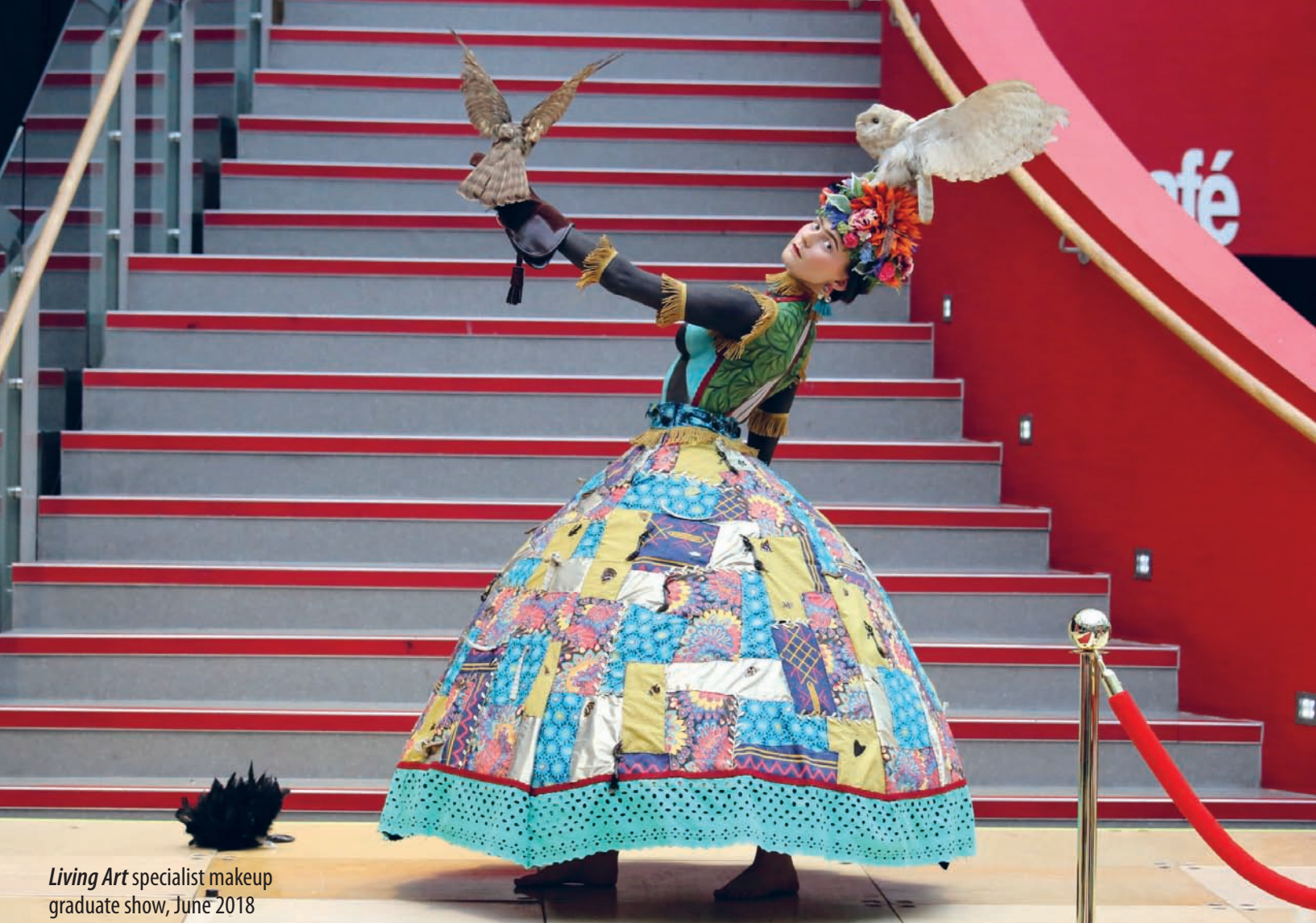
Living Art specialist makeup graduate show, June 2018