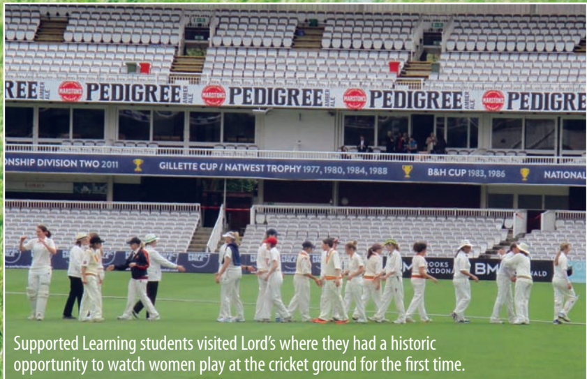
Supported Learning students visited Lord's where they had a historic opportunity to watch women play at the cricket ground for the first time.