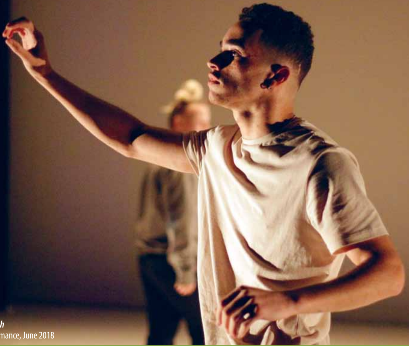
The Aftermath Dance performance, June 2018